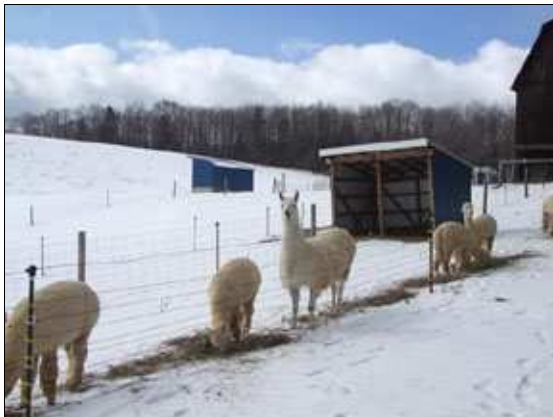
Zeus and alpacas

In the pasture he often positions himself as a guard with the alpacas. He notices everything first and takes the front position. But he is way too nice to them - he let's them eat his food. He doesn't want to eat separately, so we try to stand with him while he eats so he gets enough.