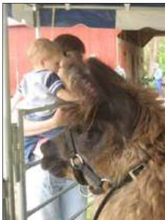
Vision the llama and his admirers at Heritage Days

I took animals to the Southern Illinois University - Carbondale Agriculture Industry Day on Friday, April 17. I had one llama and three alpacas BUT two SELR supporters brought two llamas and spoke glowingly about SELR and "rescue" llamas. It was great.