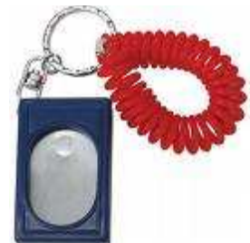
Example of a clicker used in training. Clickers are available for sale online or at most large pet stores.

BTW, Hugo used to stay 20 feet from me. He now greets me at the fence and takes goodies from my palm. He's learning!