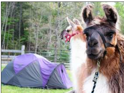
Llama Attendees at '09 Pack Trials

Sunglasses popped on and off the face as the weather changed so quickly.