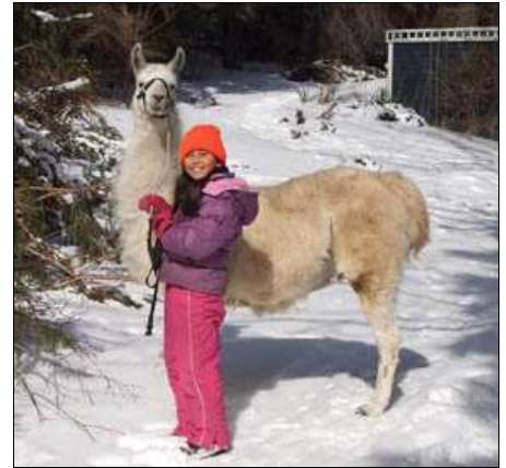
Zeus and Galen