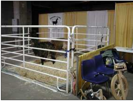
Llamas at Kansas City Pet Expo

I spent April 18 at the Kansas City Pet Expo. The Missouri Llama Association had two mini-llamas there and several of the women were spinning. We had a video going and pamphlets available. It was a busy day, mostly telling everyone what a llama can do.